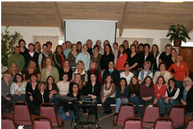
2008 B.F. Women's Retreat

Prayerfully consider coming to the women's retreat this year. It will not only be relaxing for you, but you will grow in your relationship with the Lord and build some great friendships as well.